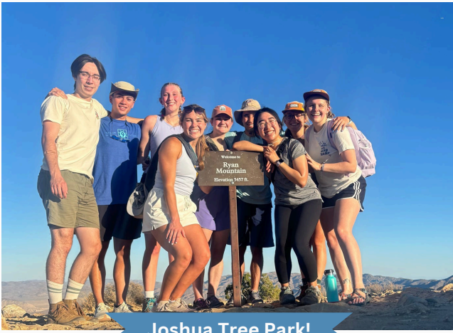
Joshua Tree Park!

Throughout the summer, multiple different healthcare professionals led training sessions to teach the students various aspects of whole person care. The students were taught the ethics of spiritual care, how to take spiritual histories, and how to pray with patients. They then applied what was learned by practicing spiritual care with patients in the hospital. There were also opportunities to shadow physicians practicing whole person care in a variety of specialties, including primary care, neurology, and oncology.