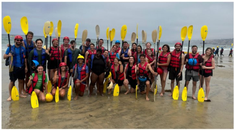
Kayaking in La Jolla!