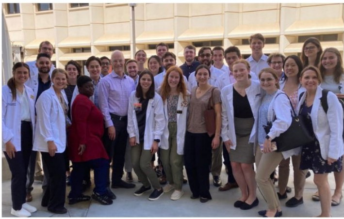
Students going to take spiritual histories and provide spiritual care at Loma Linda Medical Center