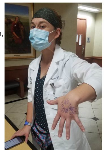
No paper? Improvise!