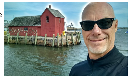
North of Boston, the iconic Motif Number 1.